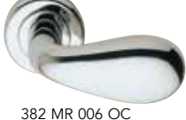
382 MR 006 OC