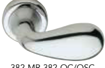
382 MR 382 OC/OSC