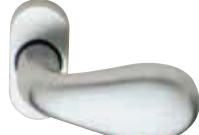
382 MR 009 OSC