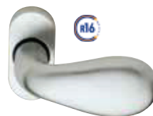
382 MR 916 OSC

Per caratteristiche tecniche rosette vedi apposito capitolo soluzioni tecniche e componenti / For technical specifications rosettes see specific section technical solutions and components