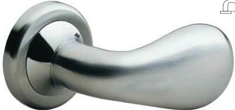
382 MR 382 OSC/OC