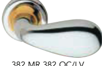
382 MR 382 OC/LV