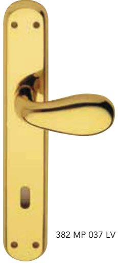
382 MP 037 LV