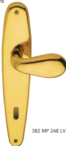
382 MP 248 LV