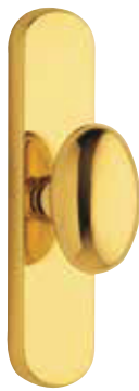
382 MA 070 LV 382 CR 070 LV