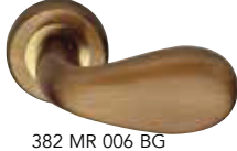
382 MR 006 BG