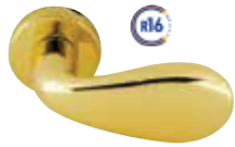
382 MR 416 LV