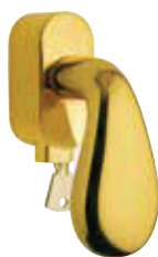
382 DK C67 LV

* Placca adatta a movimenti intercambiabili Plate suitable to interchangeable movements