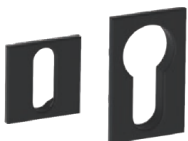
Q22KN - Q22KY